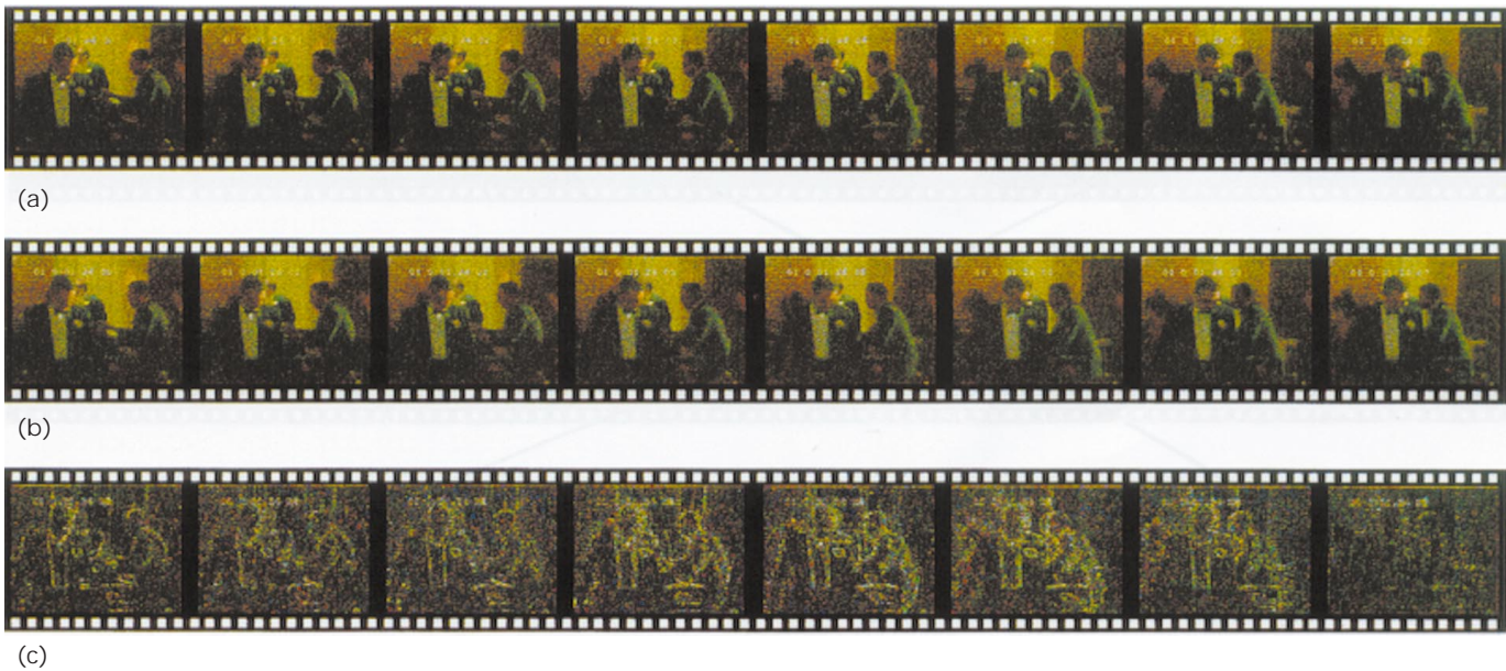
Figure 3. Demonstration of the XYZ video compression technique using eight frames from the movie “Dick Tracy.” (a) Original sequence, (b) decompressed sequence (compression ratio = 101.7, RMS = 0.120), and (c) error between frames multiplied by 16.