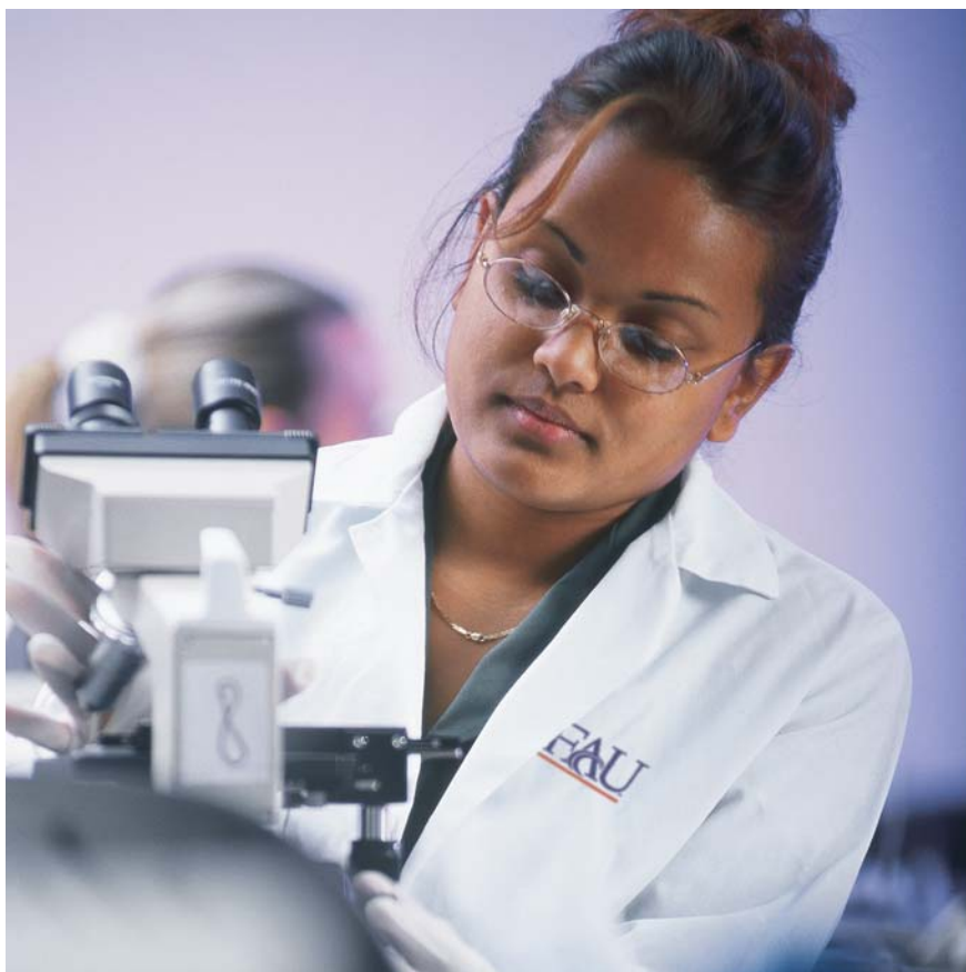
The College of Engineering and Computer Science collaborates with the FAU Charles E. Schmidt College of Science.