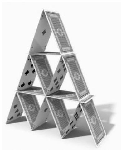
Figure 2: A pyramid built out of playing-cards.